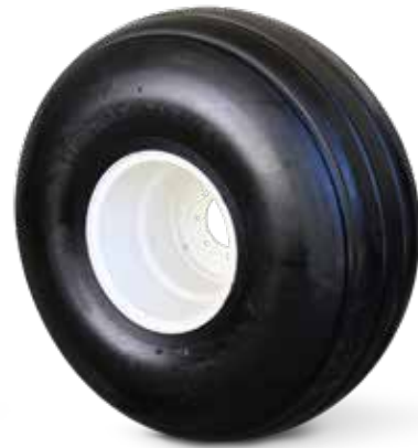
21.5 x 16.1 14 Ply

** Images shown for approximate size and profile of tire and rim package only. Relative wheel picture sizing is approximate.