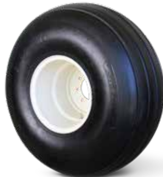
19L x 16.1 12 Ply