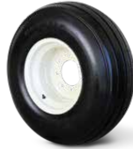
12.5L x 15 12 Ply