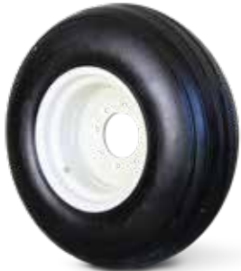
12.5L x 16 14 Ply