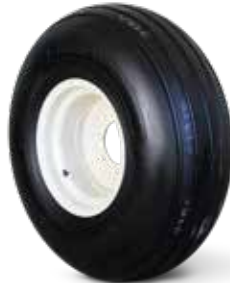
14L x 16.1 8 Ply