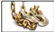
SAFETY CHAINS Safety chains to help provide safe towing

Welded jack stand supports the trailer chassis when not in use. It features a quick release foot to partially raise it before cranking.