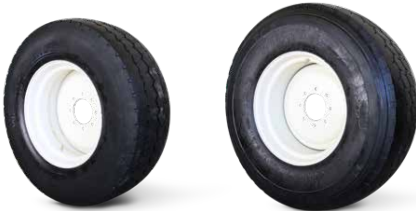
385 x 22.5 (15 x 22.5)