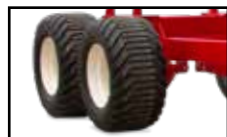
TANDEM WALKING BEAM AXLE Ensures weight is evenly distributed on the back wheels across a variety of terrain. Triangulated for increased strength the tandem axle uses two mounts reducing flex under travel.