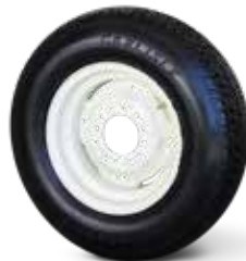
225/75 R15 Load Range D