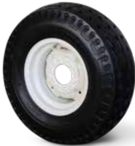
11L x 15 Load Range F