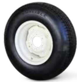
235/85 R16 Load Range F