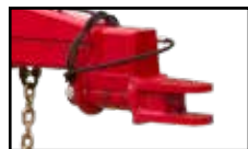
PIVOTING HITCH The pivoting clevis helps to reduce the operating tension at the hitch, allowing the towed unit and the tow vehicle to track independently over uneven ground.