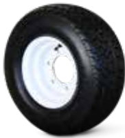
20.5 x 8-10 Load Range F