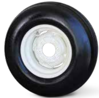
11L x 15 Load Range F