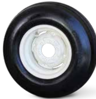
11L x 15 Load Range D