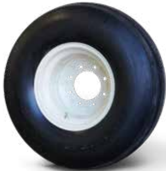
12.5L x 15 Load Range F