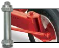
TAPERED ROLLER BEARINGS IN MAIN PIVOT POINTS

Take the precision work out of hooking up by freely moving the tongue into place and watch it lock into place as soon as it's in motion.