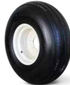
14L x 16.1 12 Ply