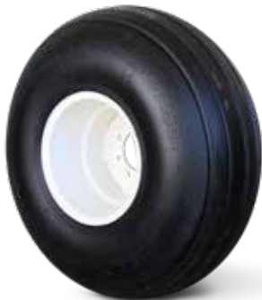
16.5 x 16.1 10 Ply