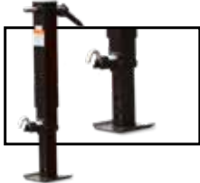
HEAVY DUTY JACK (with standard variable adjustment)

Welded jack stand supports the trailer chassis when not in use. It features a quick release foot to partially raise it before cranking.