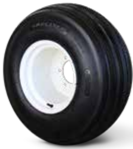
26x12 12 Ply