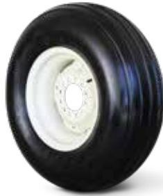
11L x 15 8 Ply