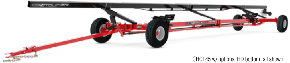
CHCF45 w/ optional HD bottom rail shown