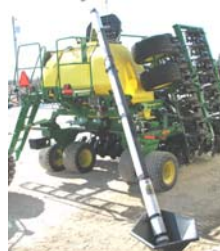
18' Single Auger for John Deere N530C Air Drill