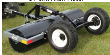
Hydraulic Lift Roller