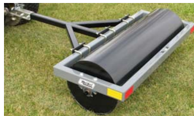
Less Wheel Kit Roller