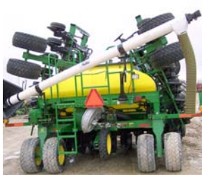
14' Single Auger for John Deere 1690, 1890 & 1990