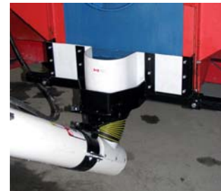
Straight Side Kit