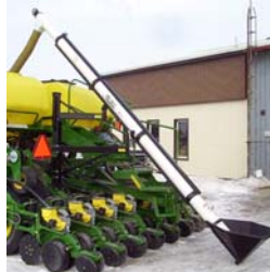
18' Single Auger for John Deere 1790