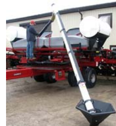
20' Single Auger for John Deere 1560/1590 & Kinze 3600 ASD & CIH 1240 Pivot Planter