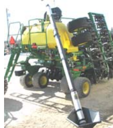
18' Single Auger for John Deere N530C Air Drill