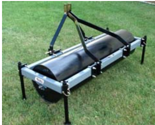
3 Point Hitch Roller

PULL-TYPE ROLLERS standard with a 2" ball coupler for optimal following of ground contours. (optional clevis available)