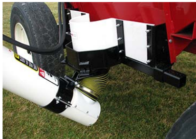
Ultra Glide Hopper

Options include: 3 stage telescopic downspouts, 60" hopper for larger door openings, electric on/off control kits, hydraulic power units and mounting kits for straight door sided gravity boxes.