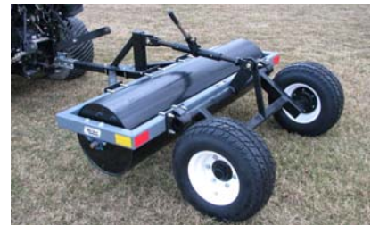
Manual Ratchet Lift Roller