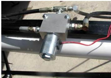
Electric Solenoid Valve Kit