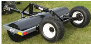
Hydraulic Lift Roller