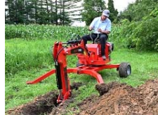
1764 lbs Digging Force