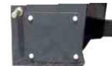
Clean Out Hatch