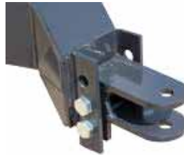
Adjustable Hitch ensures the mower is level