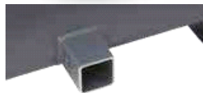
2" Hitch Receiver