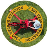
360 Degree Rotation