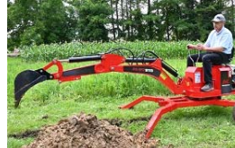
Curved Boom Design