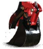
12" & 18" Bucket w/ Mechanical Thumb

100-120 LEHIGH AVE. P.O. BOX 928 BATAVIA, NY 14021 PHONE: 800-252-1552 FAX: 888-852-7406