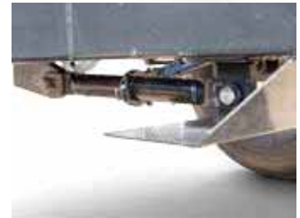
Hydraulic (option) lifts the mower up and down hydraulically