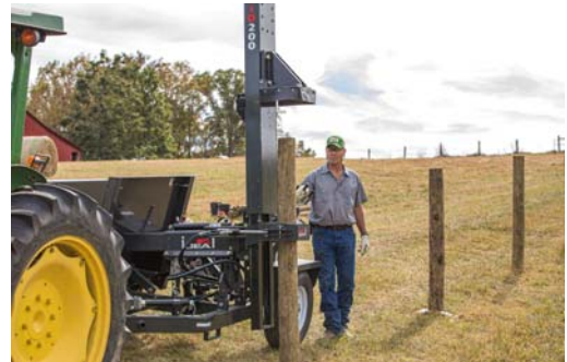
ID 200 Series Trailer Models