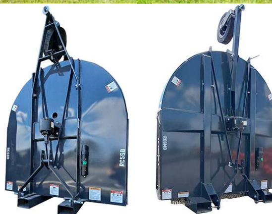
Standard Duty Cutter