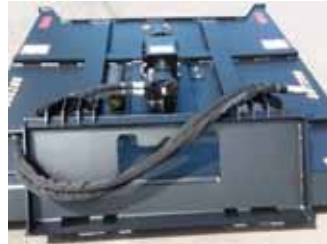
Universal Pick-Up Plate

The standard duty cutters are designed to cut up to 2" diameter. Hoses and couplers are included. One year warranty on the structural steel.