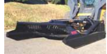
7201 (OPEN FRONT)