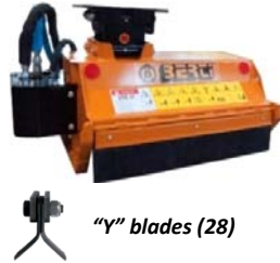
"Y" blades (28)