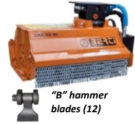
"B" hammer blades (12)