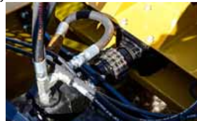
Auxiliary electrical connection

100-120 LEHIGH AVE. P.O. BOX 928 BATAVIA, NY 14021 PHONE: 800-252-1552 FAX: 888-852-7406