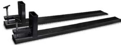
BOF (Clamp On)