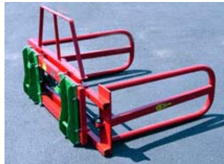
SBH Square Bale Hugger, Opens to 76", Closes to 28"