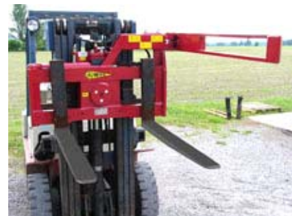
K53AI Fixed Side Arm Box Rotator