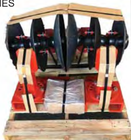
ROW DISC SERIES