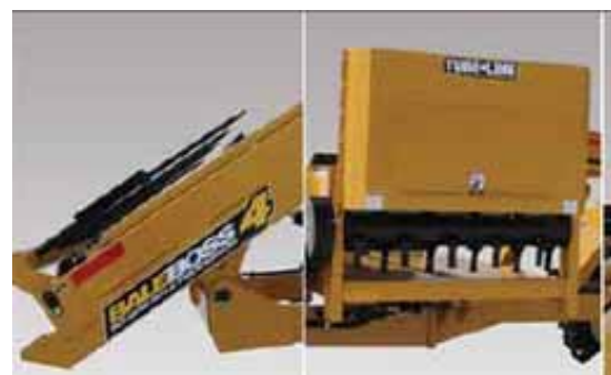
Spears with cutting knives