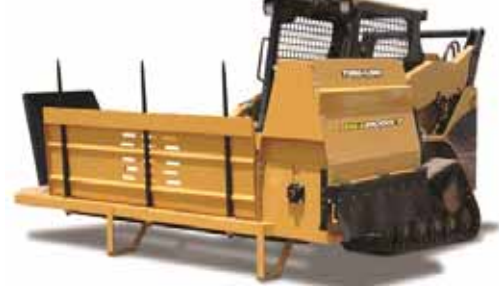
Boss I Handles Mid-Size Big Square Bales up to 84" long. (30" x 32" x 84") Minimum 18GPM. (Optional top beater kit allows use with 32" x 48" bales)

The variable position chute allows you to go from bedding, to feeding, to windrowing.