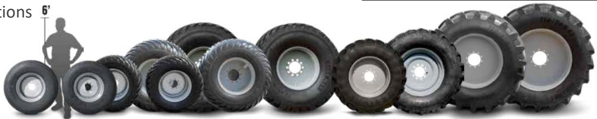
425 x 22.5 (16 x 22.5) 550/45 - 22.5 700/50 - 26.5 750/60 - 30.5 480/70 R30 600/65 R34 710/70-38 710/70-42