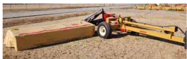
Width: 84" Length: 13'