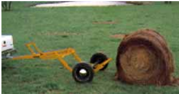
1 Back up to a bale, engage brake switch