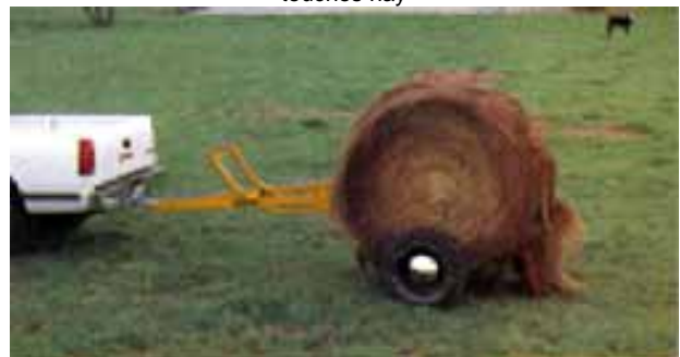
4 Disengage switch (release brakes) and go