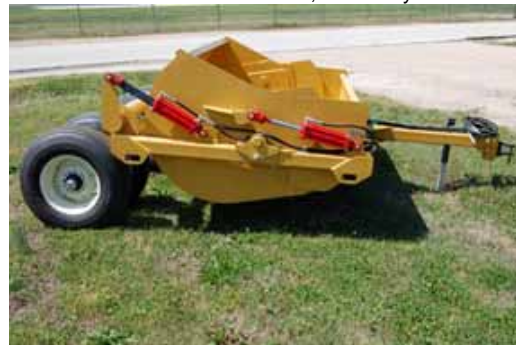
DP84HCDB with dual tires, drawbar, lift axle, and clevis hitch