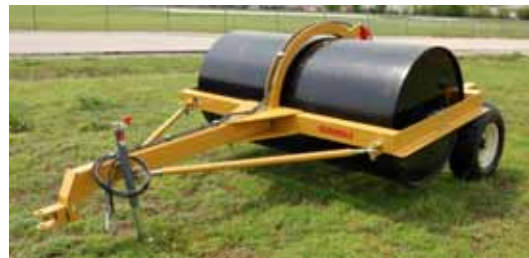
Smooth Rollers(SR Models) are the same as Pasture Punch, less tines.