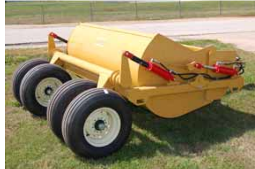
DP84HCDB with dual tires, double cylinders