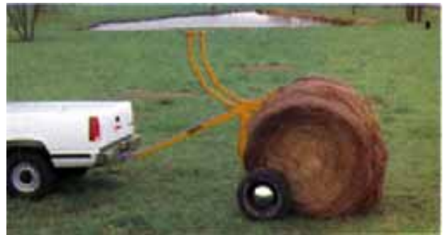
2 Continue backing until loading arm falls over frame of cradle and touches hay