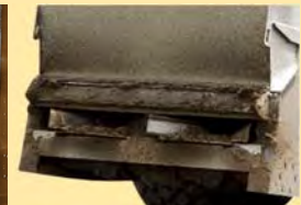
Dual Horizontal Beater Assembly