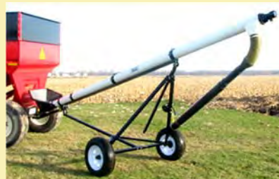
20' and 30' Transport augers