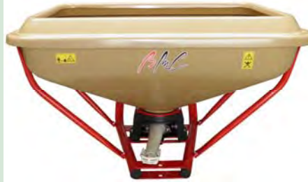
AIG Series Spreader