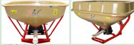
AIP Series Spreader