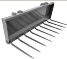
Euro Style and Flat Tine Manure Forks