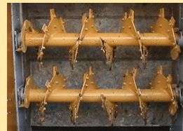
Dual Horizontal Beater Assembly