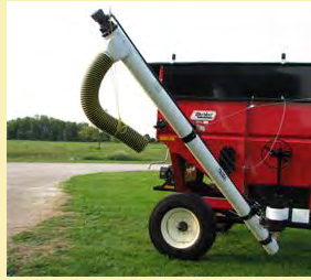
Gravity Box Augers