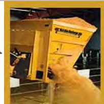
Side Discharge Buckets