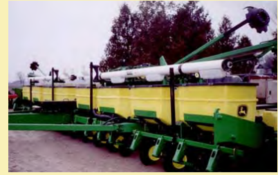
Planter Cross augers