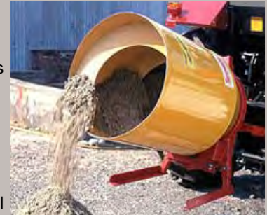
Reversible drive system

With a 10CF and 20CF capacity, this mixer rotates in one direction for mixing and in the opposite direction for unloading. The hydraulic motor drive makes it easily controlled from the tractor seat via the external services spool valve.