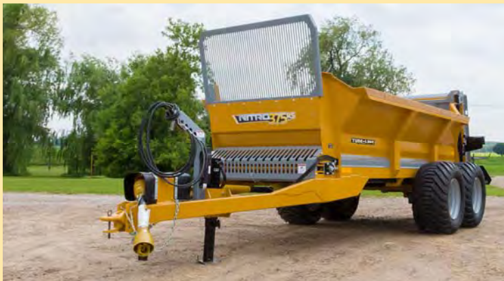
Nitro 375RS - Tandem Axle

The interchangeable quick-drop beater system allows operators to conveniently switch between the vertical or poultry beater assemblies offering flexibility to both producers and custom operators. Each poultry litter beater assembly comes standard with Gearbox drive system to maximize distribution while metering material flow.