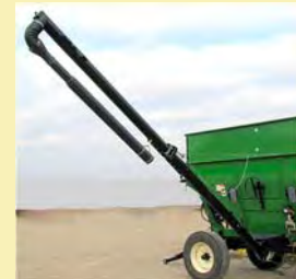
Maximum Reach Augers