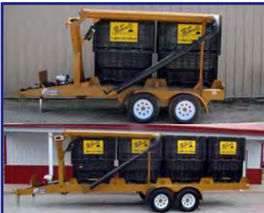
2 Box Low Profile