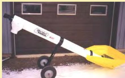
10' and 12' Transfer augers