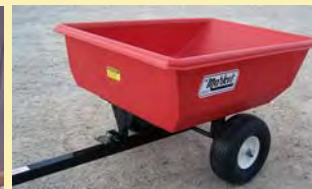
Plastic Dump Carts