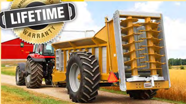
Nitro 600 - Single Axle