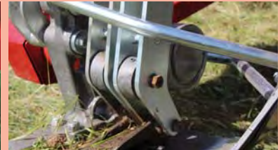
"Wobble" drive— no pitman.