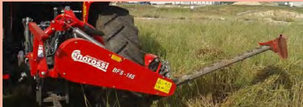
Manual or hydraulic lift