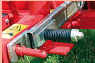
Spring loaded breakaway